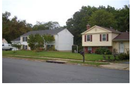
previous photo next photo

Located on the border of Fairfax and Loudoun counties, Kingston Chase is convenient to Route 7, the Dulles Toll Road and Route 28, and is approximately 25 miles from Washington, D.C. While it is not located within the boundaries of the Town of Herndon, the Old Town area of Herndon is within walking distance via the Washington & Old Dominion